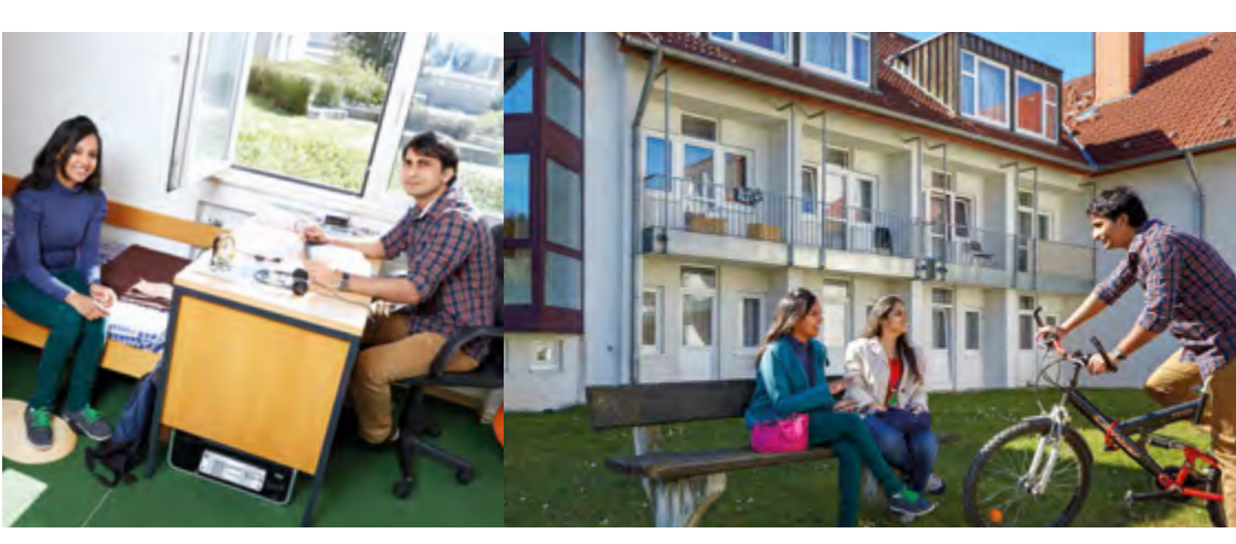
Dormitory in Dieburg

Please note that you can only move in into your accommodation from Monday to Friday during business hours of your housing agency. It is not possible to move in on Saturdays, Sundays and bank holidays. Make sure to book a room in a youth hostel in Darmstadt or Frankfurt well in advance.