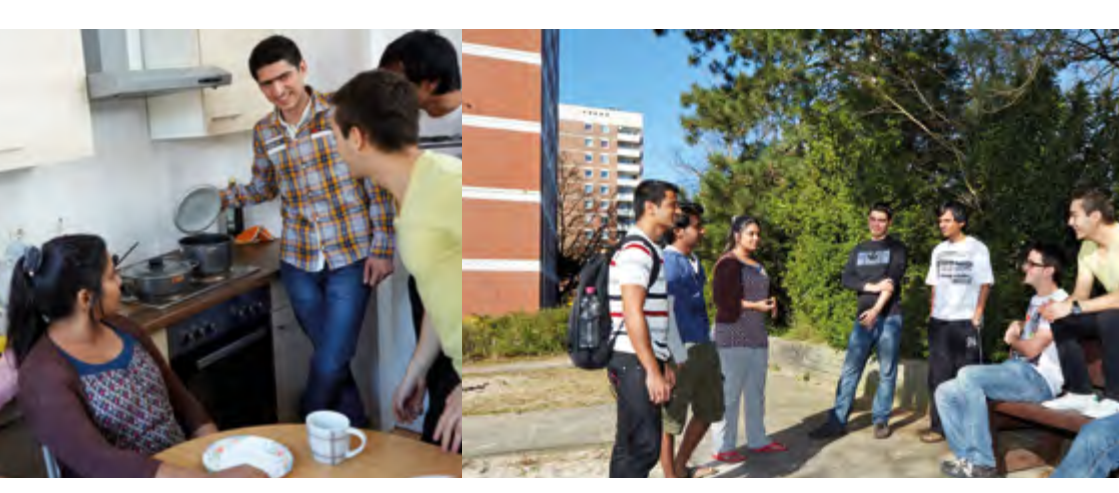
Dormitory in Darmstadt-Eberstadt

We try to consider but cannot quarantee the preferences on the application sheet.